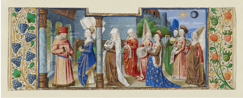
HENRI DE VULCOP, LADY PHILOSOPHY PRESENTING THE SEVEN LIBERAL ARTS TO BOETHIUS

THE FEAR OF THE LORD IS INDEED CENTRAL TO WISDOM, BUT WISDOM IS NOT A SELF-CONTAINED SYSTEM UNIQUE TO CHRISTIANS, BUT AN ATTUNEMENT TO A SHARED REALITY, A REALITY THAT UNBELIEVERS ARE SOMETIMES CONSIDERABLY MORE ATTENTIVE TO THAN WE ARE.